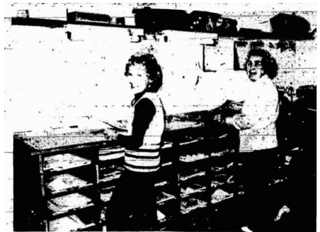
A LONG SLOW process is gradually being completed, with the help of the Friends of the Library. The effort is being made to organize and microfilm all issues of the Morgan Hill Times and San Martin-News from the first issue, dated April 12, 1894, to the present. Of the total number of publications, nearly 4,700 issues, almost all are in existence and have been placed in

Access from the Library: From within the library, you can access our entire collection of Santa Clara County historical newspapers from 1895-2018.