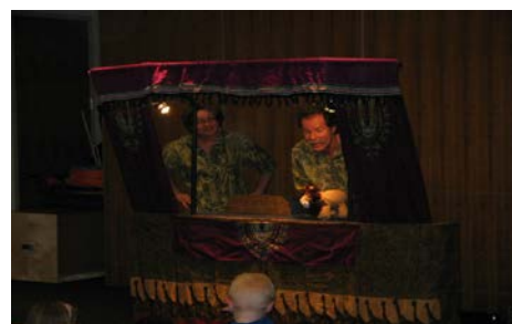
Cinco de Mayo Puppet show sponsored by the Friends

The Friends have supported many great programs in the past few months, including Valentine card craft, Zumba!, do it yourself nail art, bookmaking for kids, kids pizza cooking class and sushi making for adults. The candy jewelry event had over 50 teens participating!